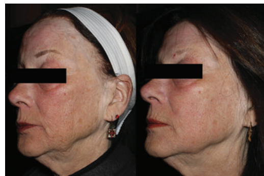
Fig. 3. Sixty-two-year-old patients before (left) and 3 months after (right) the final treatment with the EMFACE device showing wrinkle severity improvement with visible jawline definition.

The appearance of facial wrinkles and rhytides was significantly ( p < 0.05 ) improved after the treatment using a novel device combining RF and HIFES technologies. The FWES results showed a shift from class II ( 5.2 \pm 0.4 points) to class I ( 2.9 \pm 0.4 points) indicating only fine wrinkles. The 3D analysis demonstrated a significant wrinkle (36.6%) and skin texture (25.2%) improvement maintained up to 3 months. The majority of patients (90.9%) agreed the therapy was comfortable and there were no negative responses from the SSQ. In addition, patients were satisfied especially with the lifting effect visible after the final treatment and with treatment results (83.3%) in general—outcomes leading to minimization of signs of aging.