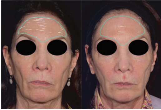
Fig. 1. Seventy-five-year-old patients before (left) and at 1 month after (right) the final treatment with the EMFACE device. Photographs were taken using the 3D photograph imaging system LifeViz ® Mini (QuantifiCare S.A., France). 3D, three-dimensional.

1-month follow-up visit ( p < 0.001 ). At the 3-month follow-up, a significant improvement ( p < 0.001 ) by +5.1 \pm 0.6 points was achieved.