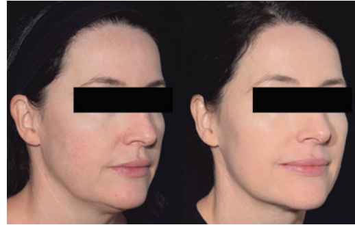
Fig. 2. Forty-six-year-old patients before (left) and at 3 months after (right) the final treatment with the EMFACE device. Photographs were taken using the 3D photograph imaging system LifeViz ® Mini (QuantifiCare S.A., France).

The majority of patients (87.5%, N=21 ) agreed that the therapy was comfortable and 91.7% ( N=22 ) patients reported no or minimal discomfort during the treatment. There were no negative responses from the SSQ evaluation immediately after the treatment. At 1- and 3-month follow-ups, satisfaction with results was high, achieving 95.5% and 95.0%, respectively. In addition, 87.5% of patients reported more lifted and tighter skin after the treatment during the whole study. The lifting effect is demonstrated in Figure 4. No adverse events or treatment-related side effects were observed.